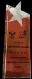
HRDF Training Provider