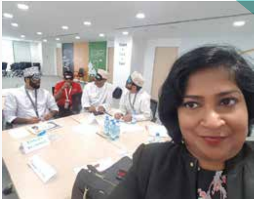
Oman Oil Refinery 2019 - Root Cause Analysis