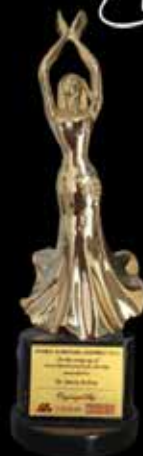
Winner of "Professional Award" by Malaysian Indian Business Council Women Achievers Award