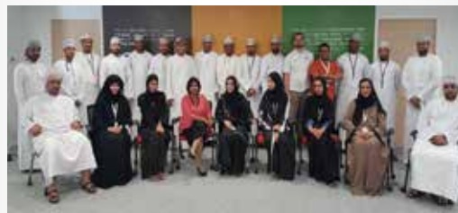
Oman Oil Refinery 2019 - Change Management