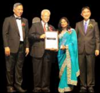
SME Recognition Award Rising Star Award 2015