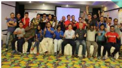
ExxonMobil On-boarding 2018