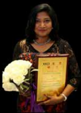
ASEAN Outstanding Women Entrepreneur Award 2016