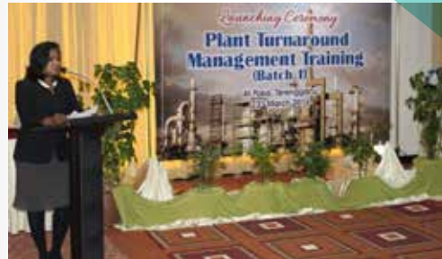
Plant Turn Around Management Training 2016